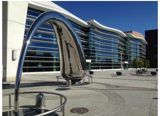
Mayo Civic Center - Rochester, MN