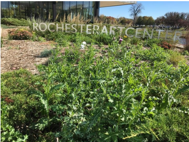
Canada thistle in the landscaping