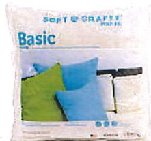
Soft N Crafty Basic 18" x 18" Pillow