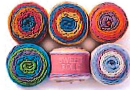
Premier® Yarns Sweet Roll Yarn