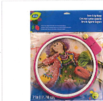
LoRan Sure Grip Hoop 7"