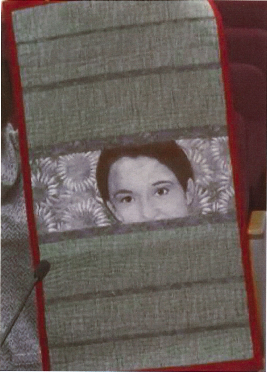
EXHIBIT tabbles® A