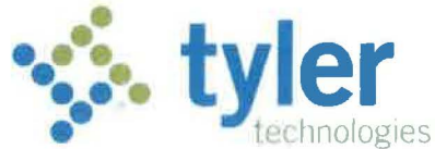
Exhibit B Schedule 1 Business Travel Policy