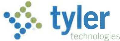
Exhibit B Invoicing and Payment Policy

We will provide you with the software and services set forth in the Investment Summary. Capitalized terms not otherwise defined will have the meaning assigned to such terms in the Agreement.