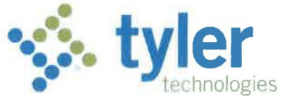
Exhibit A Investment Summary

The following Investment Summary details the software, products, and services to be delivered by us to you under the Agreement. This Investment Summary is effective as of the Effective Date. Capitalized terms not otherwise defined will have the meaning assigned to such terms in the Agreement.