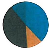
Day One IFX Balanced