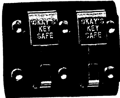
11-KN (Nickel) 11-KB (Black Special Order)

This is the Original Key Safe! If it doesn't say OKAY'S, it's not the original. Since 1959 it has been without equal for the safety of your keys. Locksmiths, prison guards, security personnel, postal workers, casino workers, janitors and police officers carry their keys on OKAY'S Key Safes. They are very popular with professional businessmen as well. The OKAY'S Key Safe is secure, convenient, handy, dependable and made in the USA! The 39-NXB (black) is non-reflective and comes with a black key ring.