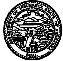
Pete Ricketts Governor