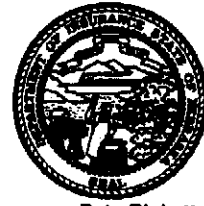
Pete Ricketts Governor