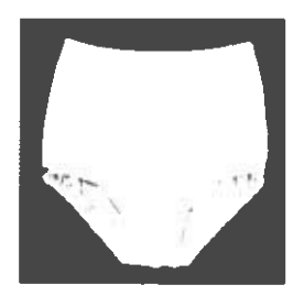
Ladies' 100% Nylon Panties