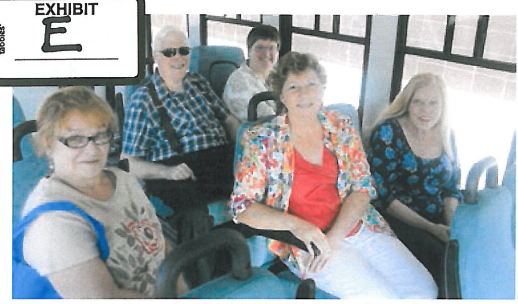
Lancaster County Public Rural Transit riders enjoy themselves as they travel to their destination.

This opens the opportunity for anyone in our service area to ride. Although many older adults and people with disabilities use the service, we have a diverse group of riders taking advantage of the convenience, inexpensive fares and ability to reach any destination in Lincoln."