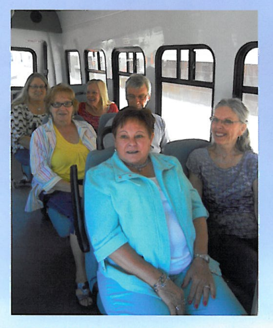
Accessible, lift-equipped buses are clean, comfortable and provide room for you and your packages.

Please note: One leg of your trip must include a stop outside Lincoln city limits (pick-up point or destination).